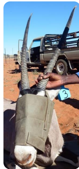
Figure 2 Oryx with face mask