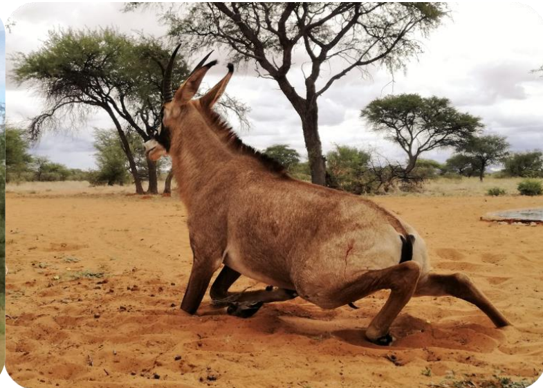
Figure 9 Waking up a kudu and a roan. Simply said, the immobilizing drugs will sit on a receptor in the nerves, and this makes the animals 'asleep'. When the antidote is given, the antidote will 'kick out' the immobilizing drugs from that receptor and sits in its place: the animal is awake again. The animal cannot be darted again for about 24h as the antidote keeps that receptor occupied; the immobilizing drugs cannot get in.