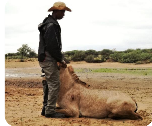
Figure 3 The correct way of holding an antelope. When there are no horns, or the horns are too small, the handler must hold the ears. The horns of young antelopes can easily break, and it is thus better to hold the ears.