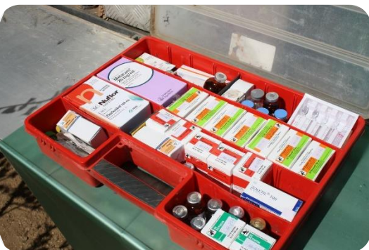
Figure 7 Other supporting drugs we always carry with

Besides the above drugs we also carry other important drugs which we use when needed, such as different types of antibiotics, painkillers, corticosteroids etc.