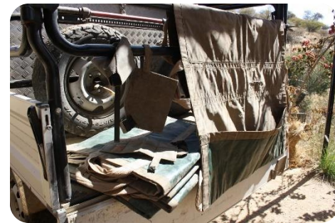
Figure 1 We will bring face masks, carrying mats etc with. Please inform us on beforehand what you need and want, and we will bring it with.