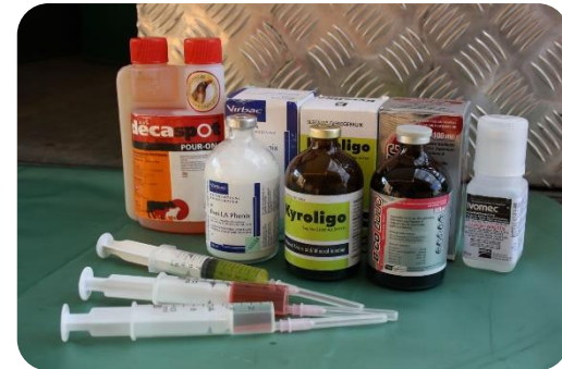
Figure 5 Supplemental drugs