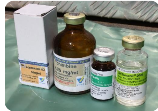
Figure 8 Several types of antidote

Once reversed, the animals may show different reactions to their new surroundings. This could be by jumping up and running away, walking quietly and curiously around, or even by charging. It is thus important that all members of the ground crew are in safety (on a vehicle and a respectful distance away) and that disturbances (noise, cars revving, people smoking etc.) are kept to a minimum.