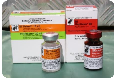
Figure 4 The immobilization drugs we use can be deadly for humans!

The drugs we use to immobilize animals is highly potent, and very dangerous (=deadly!) for humans. Not even regular vets may use it, these drugs may only be handled by registered wildlife veterinarians. It is about 600x stronger than morphine.