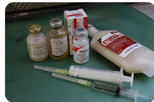
Figure 6 Vaccinations